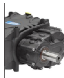
Optional gear boxes R 1,25 : 1 R 1,50 : 1 R 1,83 : 1