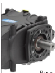
Flange for direct drive mount