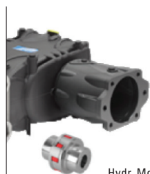
Hydr. Motor Mount SAE J 744 type C